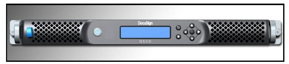
Figure 3 - DocuSign QSCD Hardware - Front